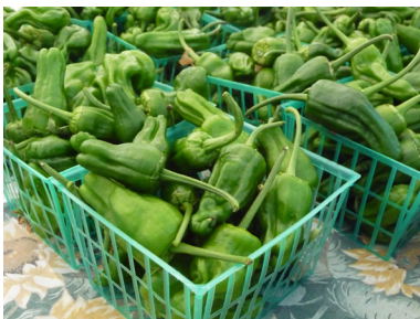
Padron peppers, a possible niche crop for selling to restaurants

Prepare - Preparation is key to sounding professional when contacting a potential buyer. Prep by reviewing the list of all the leads you will be contacting by researching their company and understanding how your product(s) can fit their needs. You also should think about new or different products that you may be uniquely able to provide them with. Almost every farmer will have tomatoes and squash in summer, so think creatively. If it's a Spanish restaurant, maybe they would be interested in buying Padron peppers. Remember, this is a give and take so you should be open to hearing product ideas from the customer and thinking how you can help their restaurant or store. This shows that you have actively taken an interest in their business and care about their needs and requirements.